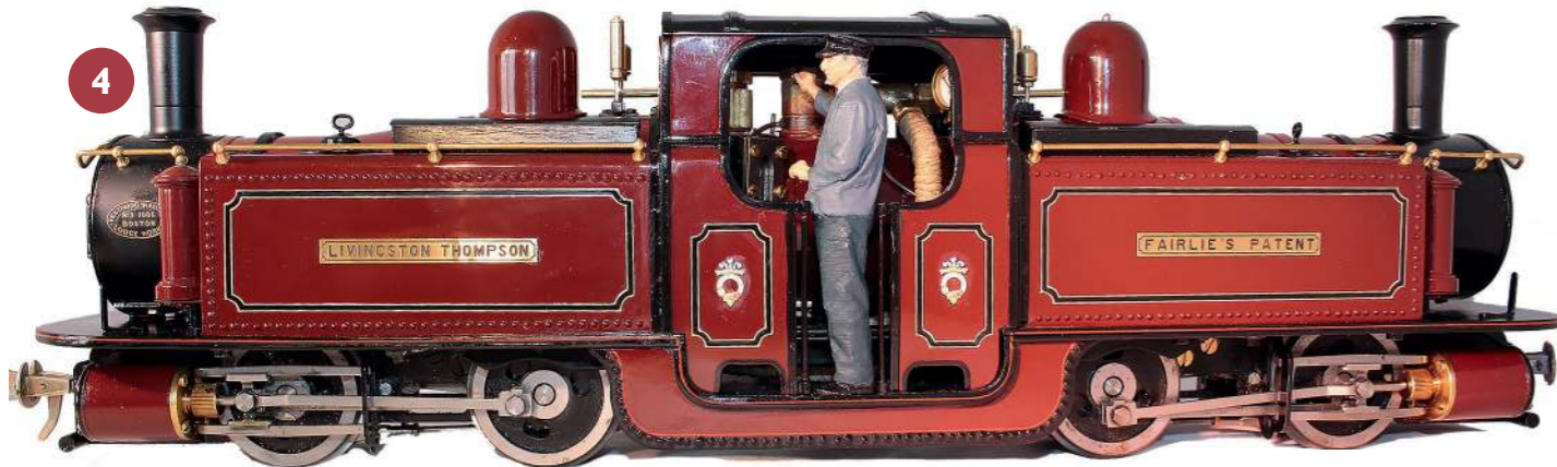
4 – Roundhouse Trophy: Geoff Munday – Festiniog Railway Double Fairlie "Livingston Thompson".