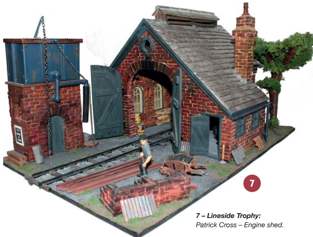
7 – Lineside Trophy: Patrick Cross – Engine shed.