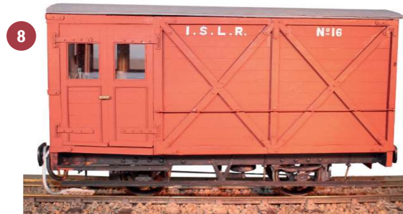
8 – Rolling Stock Trophy: Nigel Goff – Cork, Blackrock & Passage Railway brake van – 1:24 scale.