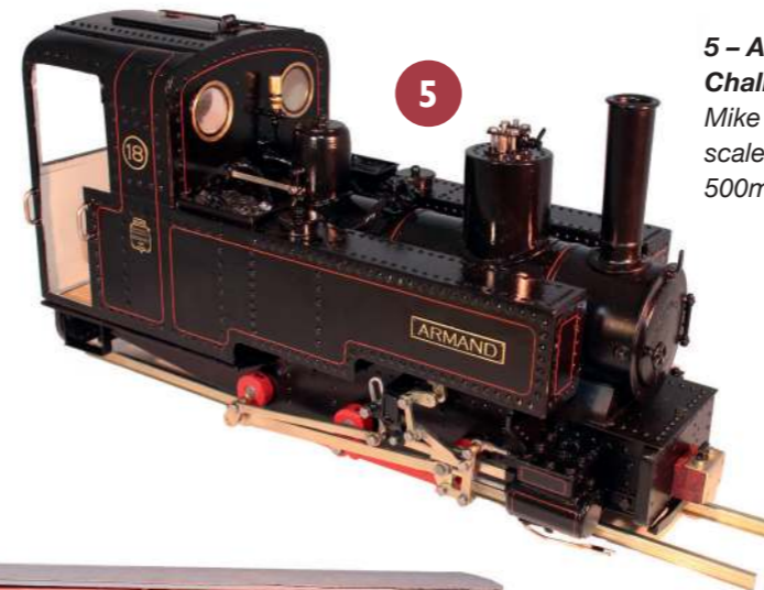
5 – Andrew Neale Challenge Trophy: Mike Dockery – 16mm scale Decauville 8 Ton 500mm gauge 0-6-0T.