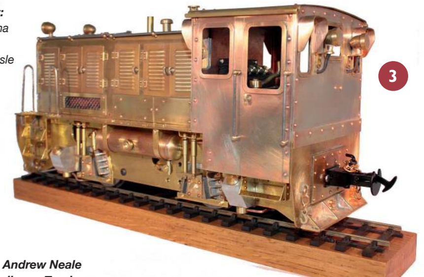
3 – Butterley Trophy: Phil Hatton – Schoema diesel hydraulic locomotive from the Isle of Man Railways.